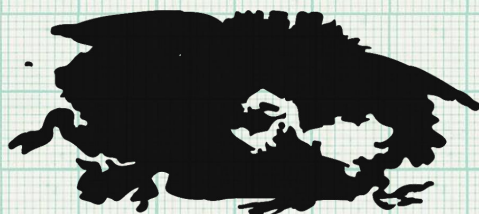
HEADQUARTERS OF THE